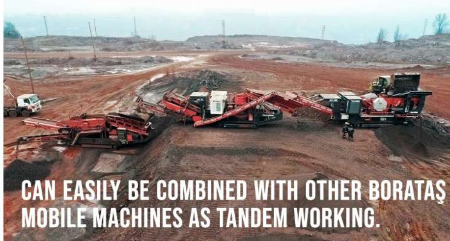
CAN EASILY BE COMBINED WITH OTHER BORATAS MOBILE MACHINES AS TANDEM WORKING.