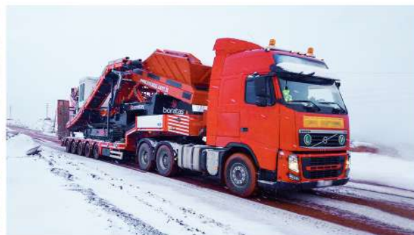
EASY TO TRANSPORT DUE TO FOLDABILITY BUILT FOR HARSH SITUATIONS INCLUDING EXTREME WEATHER CONDITIONS